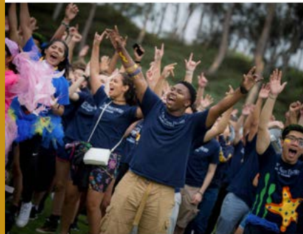
UC San Diego welcomed a record class of more than 9,000 freshmen and transfer students.

UC San Diego welcomes dynamic incoming class: 37 percent are first-generation and 40 percent come from low-income households